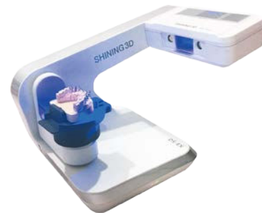
Black & White Texture