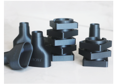
PLA-CF Wonderful smooth surface and enhanced strength.