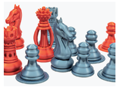
PLA-SE Easy to print and good surface.