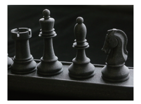
PLA-GALAXY MATTE BLACK Easy to print and has Starry sky texture matte surface.