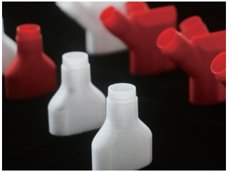
PC: High strength & High temperature resistant PETG: High transparency & wonderful toughness.